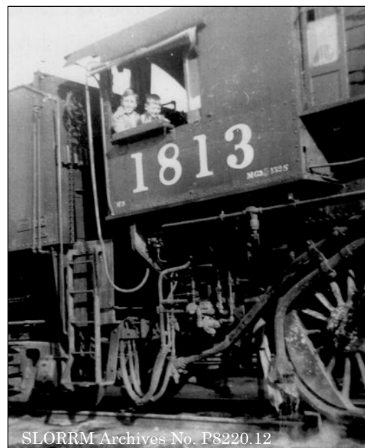
SLORRM Archives No. P8220.12

While not showing cab views, the programs by RailfanDan are outstanding. They feature expertly done aerial drone footage, mostly in the Pacific Northwest.