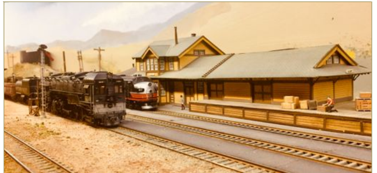
Above, a cab-forward locomotive arrives at Surf station.