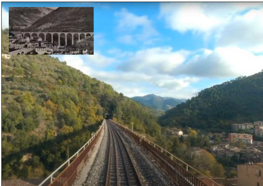
Above, the train operator's view on the way to Nice, from a YouTube video by Lorirocks777. Below, an image from RailfanDan's aerial drone video following a freight train through the Palouse River Canyon in eastern Washington state. Virtual travel is safe, and free with some ads.