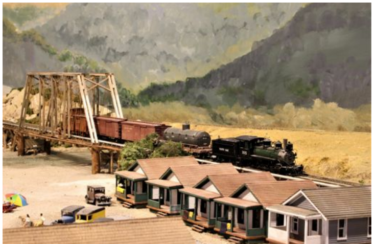
Below, a Pacific Coast Railway train of the 1930s crosses the bridge over San Luis Obispo Creek in Avila. .