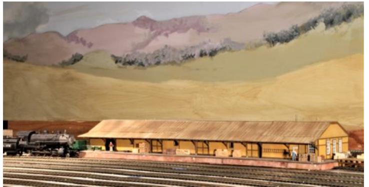
Model of the Freight House as it looked in the early 1950s.