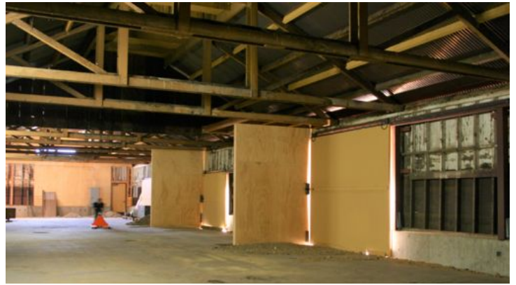
About 2010, looking toward the end of the Freight House that would become the model railroad.