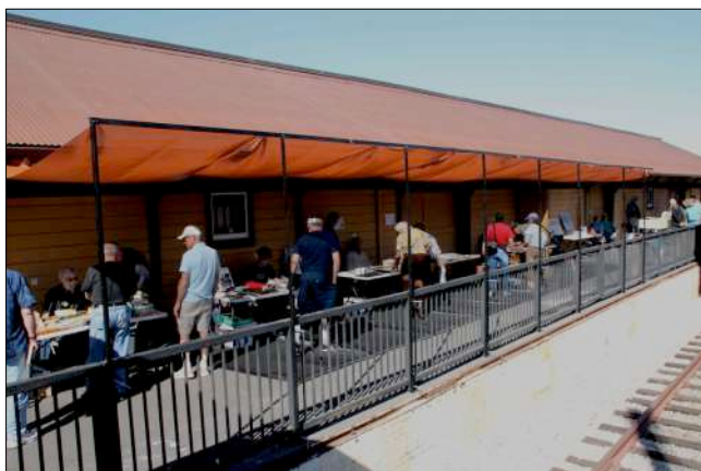
Temporary shade for the platform was welcome on a day with bright morning sunlight (above). Locomotive headlights could also be very bright, but this one has a lower wattage bulb for display (right).