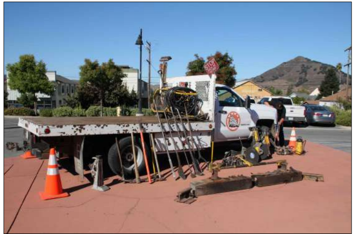
Santa Maria Valley RR demonstrated track maintenance.