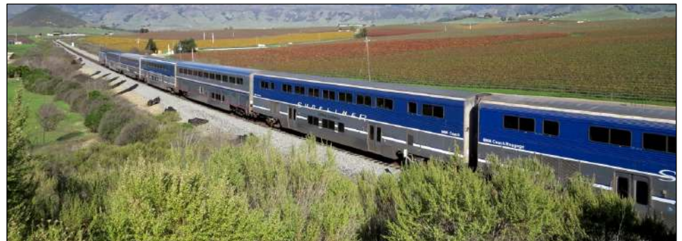
A Pacific Surfliner with at least 28 axles rolls north in the Edna Valley in 2016.

See a photo report on this year's event on pages 5 and 6, online.