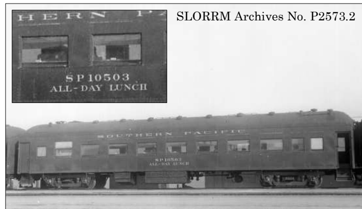
SLORRM Archives No. P2573.2