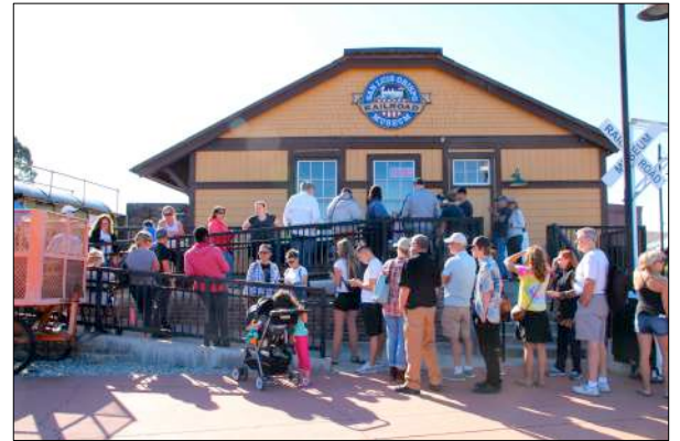
Visitors line up to enter.