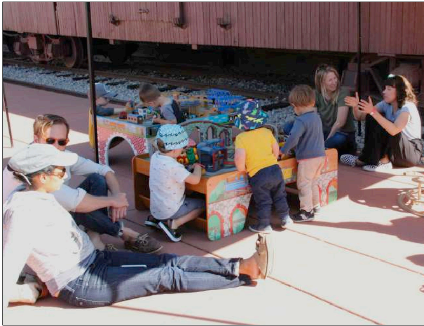
The play tables are popular wherever they are.