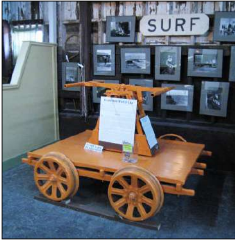
Above: Restored Southern Pacific handcar is part of the Museum display.