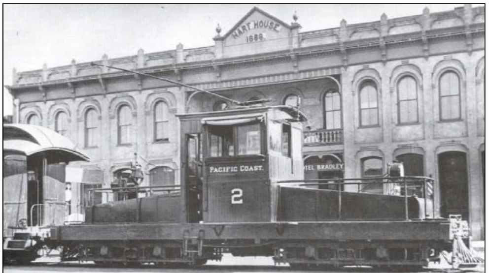
Figure 2 (above): PCRwy E-2 electric was used mostly for hauling narrow gauge sugar beet cars but is seen here with a passenger car in front of the Hart House in Santa Maria on April 17, 1909.