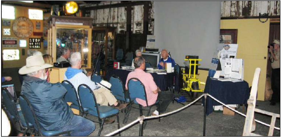
Above: Museum visitors listen to talk about 19th Century San Luis Obispo city fathers and their influence on local railroading.