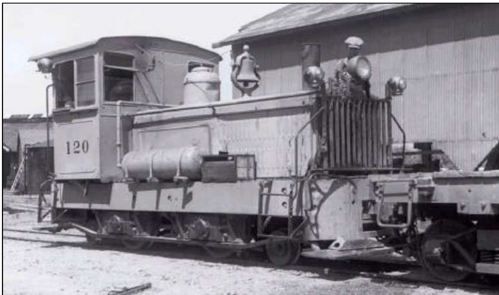
Figure 4: Engine 120, a Plymouth HL in San Luis Obispo in 1941. W.C. Whitaker

6 must have been added to facilitate running on the mainline. The locomotive was painted a pale yellow-orange with a darker roof,