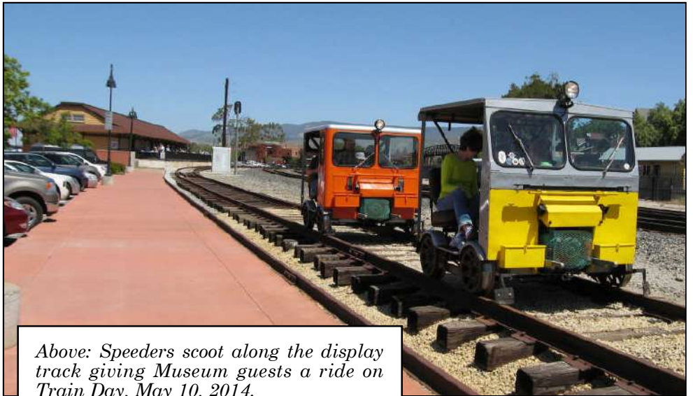
Above: Speeders scoot along the display track giving Museum guests a ride on Train Day, May 10, 2014.