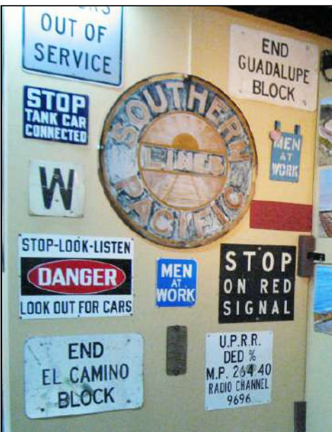
Above: Part of the Museum's outstanding collection of railroad signs.