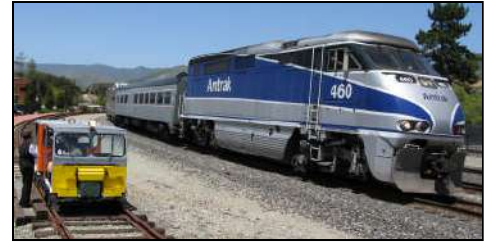
Amtrak Surfliner trundles past the Museum's speeders on its way south.