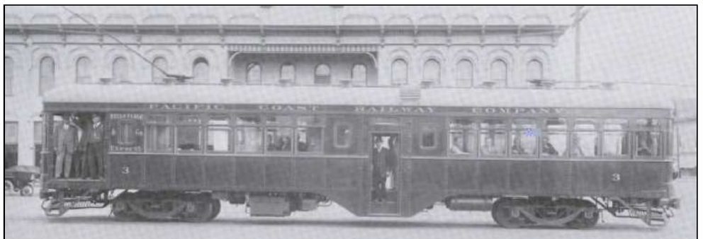
Figure 3 (below): PCRwy E-3, a center-loading interurban was purchased from the Cincinnati Car Company in 1912.

long, equipped with Baldwin traction trucks and had center opening doors for passenger loading (See Figure 3). The interior had wood paneling and, in the words of the author of the Pacific Coast Railway , Kenneth Westcott, "was far from austere." For those interested in scale drawings of these electric critters, please refer to the excellent doc-