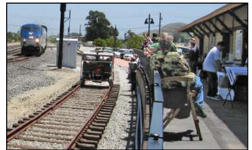
Above: Visitors line the rail as the northbound Coast Starlight approaches.

Saturday, May 10, 2014 was Amtrak sponsored National Train Day. The San Luis Obispo Railroad Museum was open to the public. Docents were on hand to explain the many exhibits. The gift shop was open and speeder rides were available. More pictures on page 7