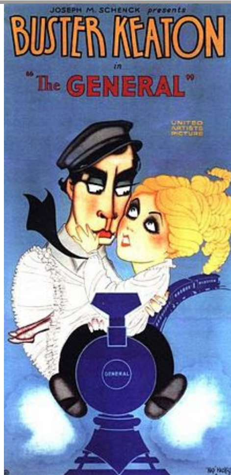
THE GREAT LOCOMOTIVE CHASE

Join us as we celebrate the 122nd anniversary of the arrival of the Southern Pacific Railroad to San Luis Obispo in 1894. We will have activities on the platform including railroad artwork for sale, a railroad swap meet, kid's play area, food, wine tasting from Pomar Junction Winery and music by South Street Roundhouse. Admission to the Museum is only $3 for adults, $2 for kids 4 to 15. (Members are FREE). We can always use donations of Brio, Thomas or similar train toys for the kid's area. Contact media@slorm.com to rent a table on the platform or to donate train toys. Thanks for your help!